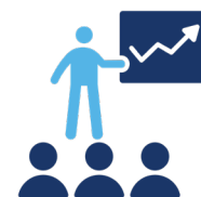
Final interview with the managing Partner

We review all applications we receive, and seek out individuals who can demonstrate insight into their experiences. Interviews for training contracts will take place in July 2024. Candidates will attend an assessment and interview with partners and senior associates. The offer of a training contract is conditional upon the provision of satisfactory references.